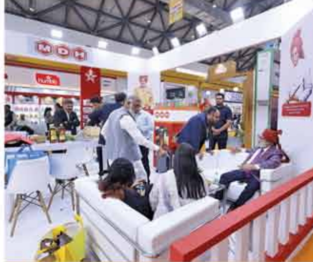
For more picture please visit our site : www.indusfood.co.in