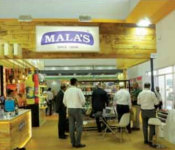
For more picture please visit our site : www.indusfood.co.in